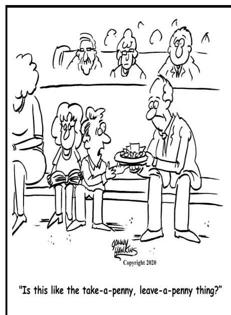
"Is this like the take-a-penny, leave-a-penny thing?"